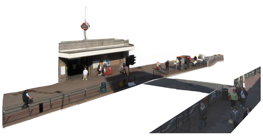
Restricted pedestrian space around station and narrow crossing are insufficient. There is no drop off space, taxi stop or meeting point.